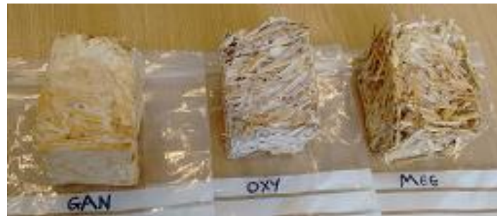
Figure 2. Three Specimens.