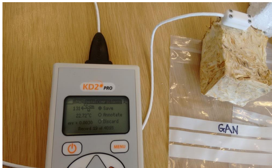
Figure 3. Thermal properties measurement.